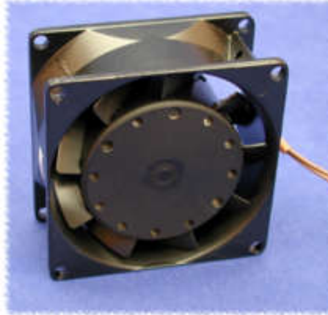
3.15" (80mm) Size