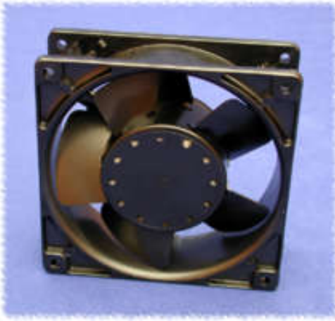
4.70" (120mm) Size